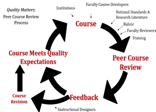
Figure 1. Quality Matters Review Process

Quality assessment measures: Quality Matters (QM) is a non-profit organization that has created assessment rubrics and measures to evaluate the quality of online courses [44]. QM rubrics consist of 43 specific review standards addressing areas such as learning objectives, assessment and measurement, instructional materials, learner engagement and interaction, and course technology. Three trained reviewers conduct the QM review process. The reviewers evaluate courses from students' perspectives and then provide suggestions on how to improve them. Figure 1 explains the QM review process for online and blended courses: