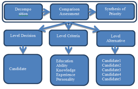
Figure 2. AHP method

In selection of lecturer, in which fundamental issues is comprehensively planning and integrated to turn down level of risk failure of selection of lecturer carefully. The problem arises because the process of determining criteria, in deciding a difficult choice consider personal accident and resulting in a complex assessment and consideration of decision makers tend to be biased and subjective. For this problem, the method of Analytical Hierarchy Process (AHP) can be used. AHP method in selection of lecturer can be seen Figure 2.