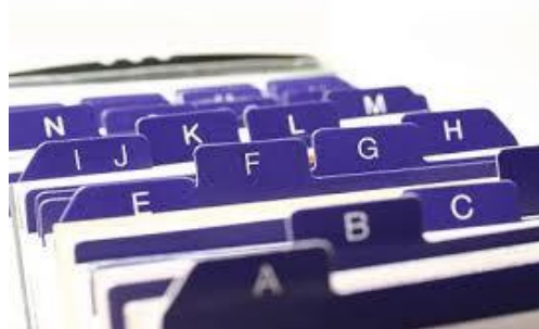
Figure 3. University Database

Each department HOD's have superior authorization over respective staffs. Respective notification about each student regarding his attendance will be sent to their parents with the mutual understanding between university database and internet.