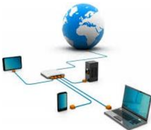
Figure 2. Gadget Interface

The staffs who do not have a subject hour on a respective day, then he/she can mark the attendance after login to university portal by connecting to the usual router installed in the office or staff room.