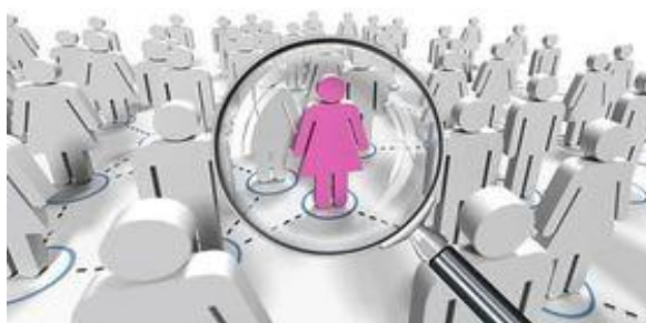
Figure 5. Position Analysis

This helps us to analyze where the particular staff is.