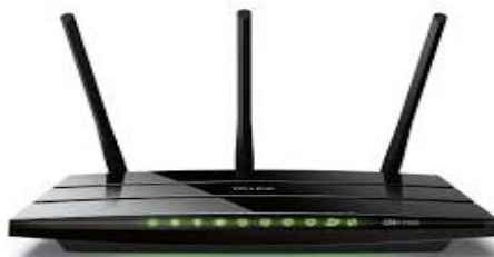
Figure 1. Basic Router